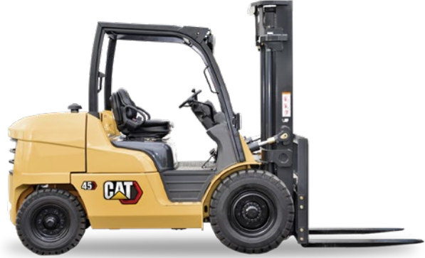
Diesel range: 1.5-23.0 tonne capacity