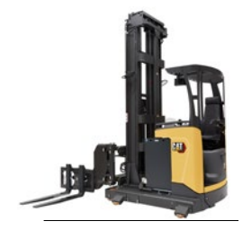
Man-Down VNA Trucks: 1.3 – 1.5 tonne capacity