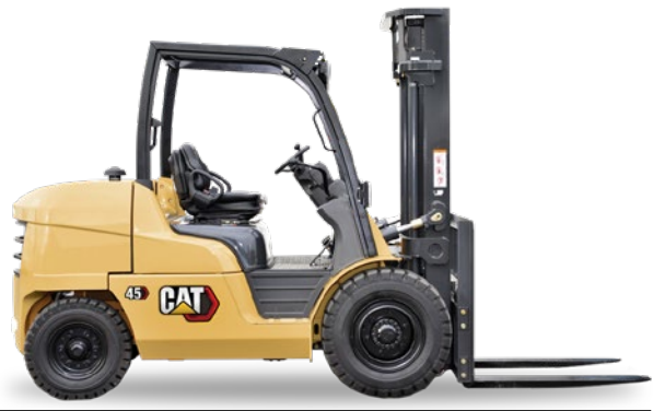
Diesel range: 1.5-23.0 tonne capacity