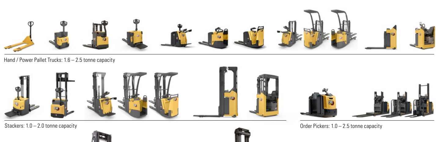
Statute is. 1.0 – 2.0 tulline capacity